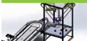
Mi5 Coffee Module