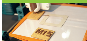
Mi5 Chocolate Printer